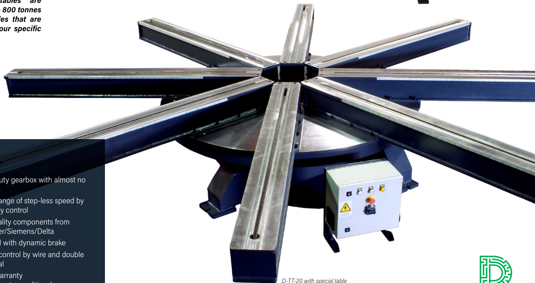
D-TT-20 with special table