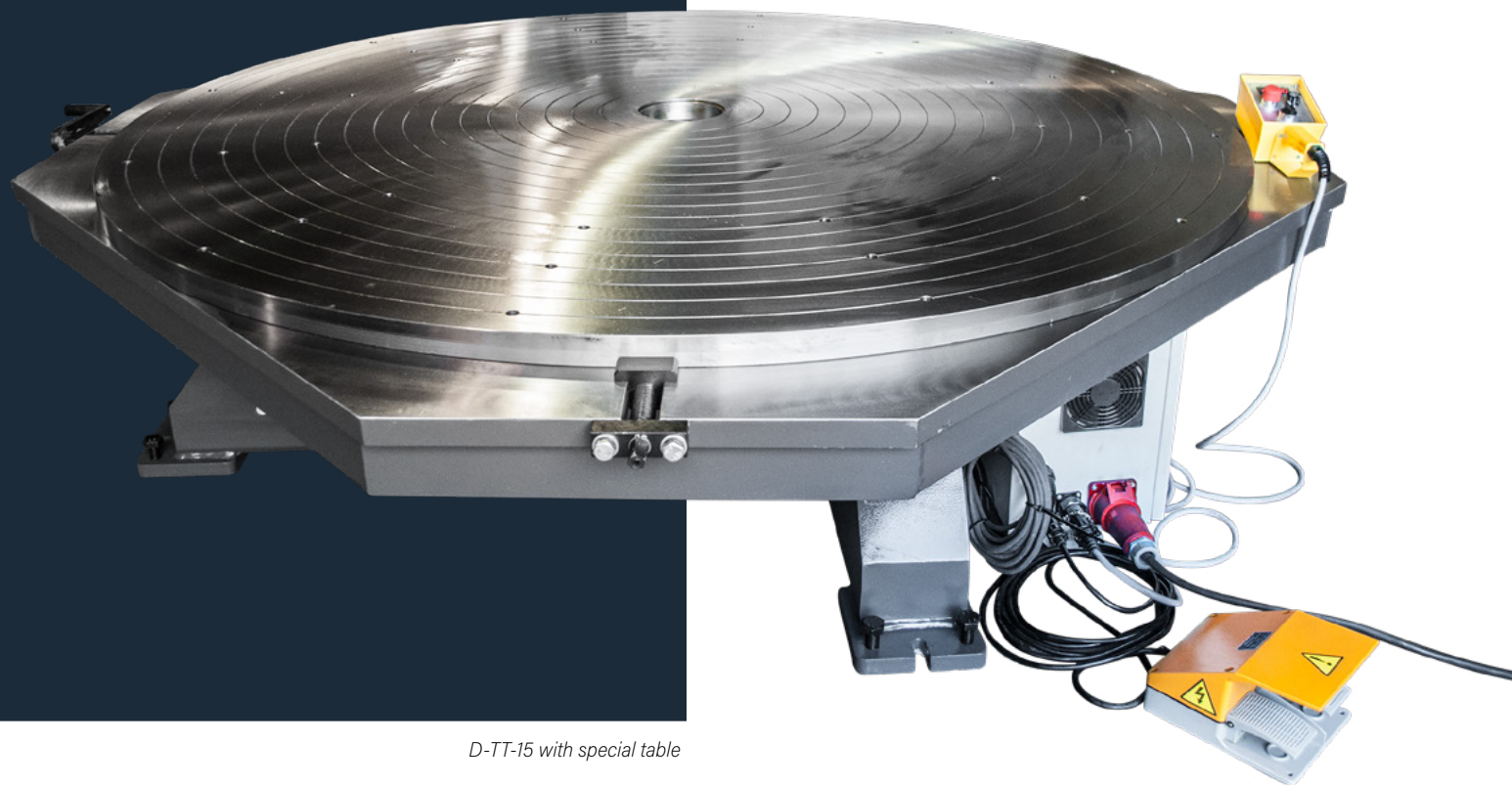
D-TT-15 with special table